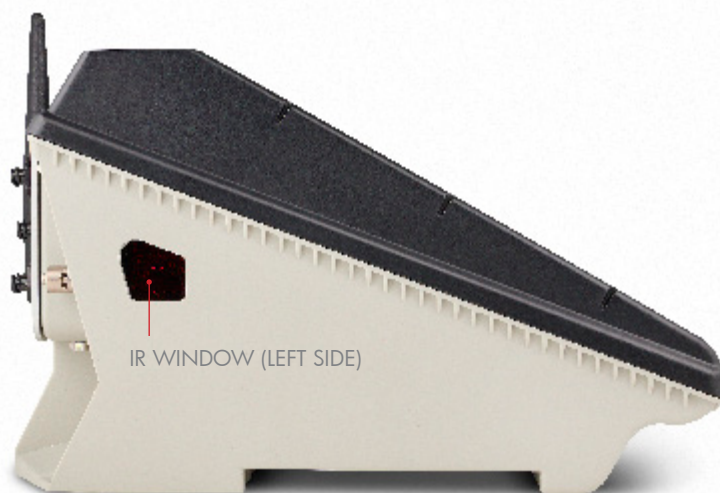
IR WINDOW (LEFT SIDE)