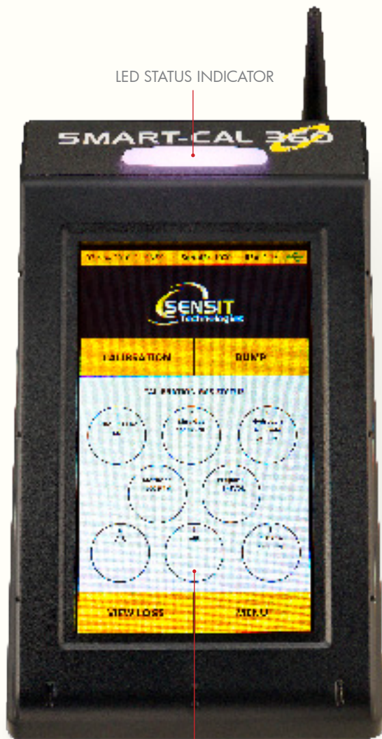
LED STATUS INDICATOR